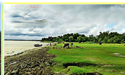
Tamluk Steamer Ghat (7km)