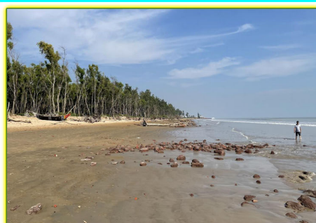
Tajpur Beach (88km)