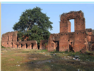
Tamluk Rajbari (6km)