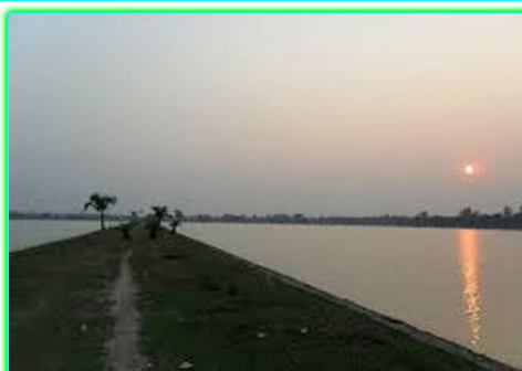
Geounkhali Tribeni sangam (27km)