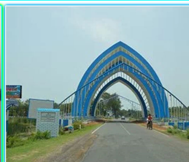
Digha Gate (102km)