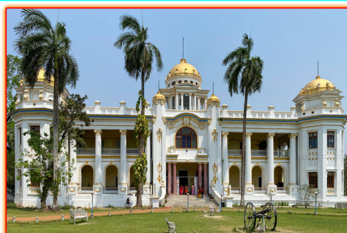
Mahisadal Rajbari (20km)