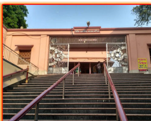
Tamluk Bargabhima Temple (5km)